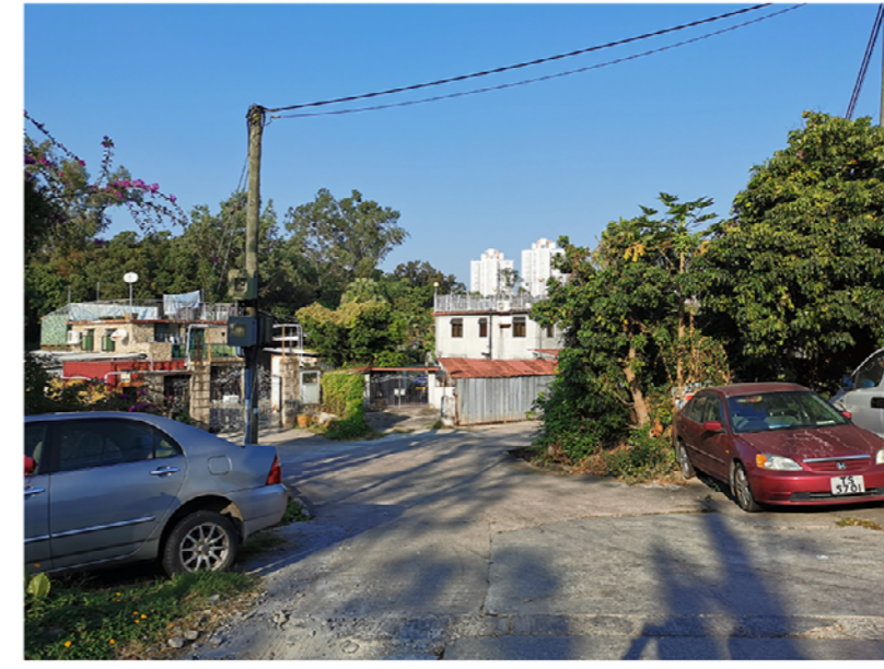
LCA3 URBAN PERIPHERAL VILLAGE LANDSCAPE