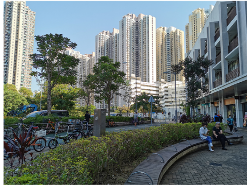
LCA2 RESIDENTIAL URBAN LANDSCAPE