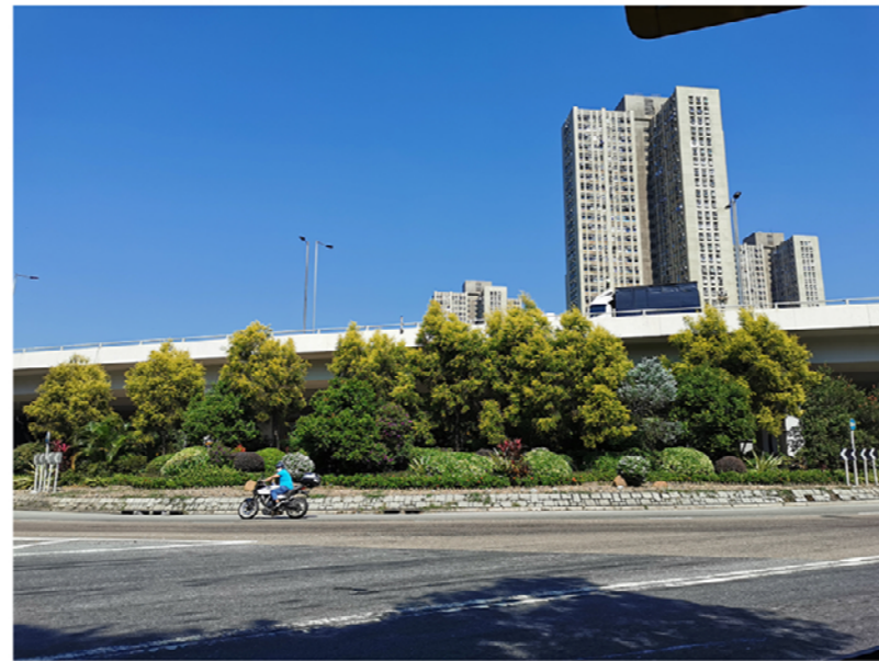
LCA5 TRANSPORTATION CORRIDOR LANDSCAPE

Date : 9/10/2020 Filename : X:\2514-331A_CE17-2019 (FL GOLF COURSE)\06_Issue Record\20201009_EIA Inception Report\CADD\CE17_EIA_Fig_005.dgn