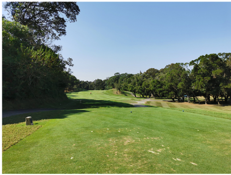
LCA1 GOLF COURSE LANDSCAPE