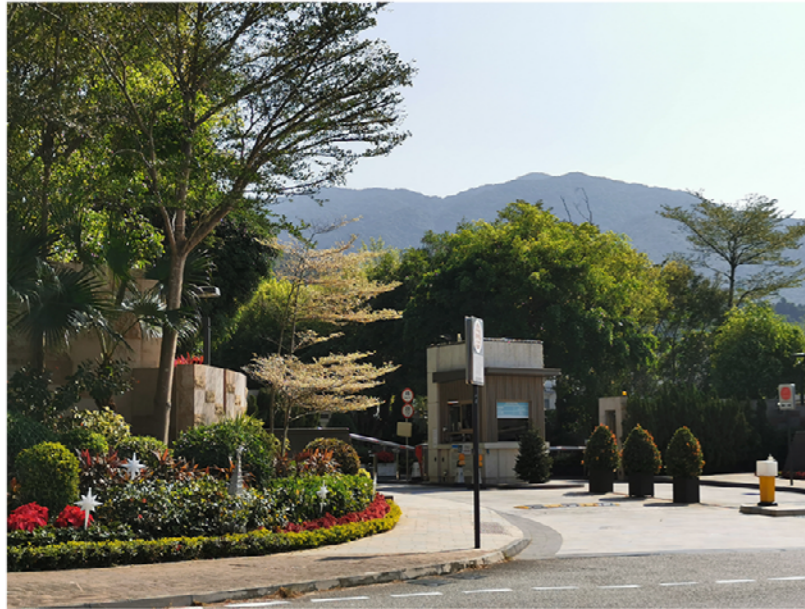
LCA4 RESIDENTIAL URBAN FRINGE LANDSCAPE